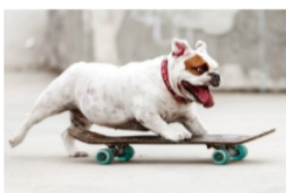
Trick Dog Titles

Looking for something fun to do at home? Titles in Trick Dog, ACT, and Rally can now be earned virtually! Click below for instructions.