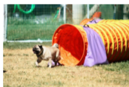
ACT 1 & ACT 2 Titles