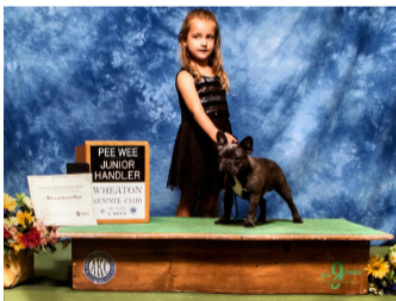
Wheaton KC PeeWee Competition