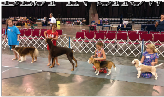
Lagniappe Classic Dog Show - see full article .