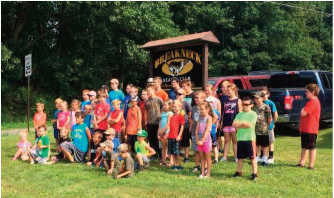
Great Two Days, Great People, Breakneck Beagle Club

program. The looks on the faces of young Beaglers who earn collars (red through silver) or a vest or chaps tell it all. The kids are proud and happy; they are becoming Beaglers and some even learn how to cook!