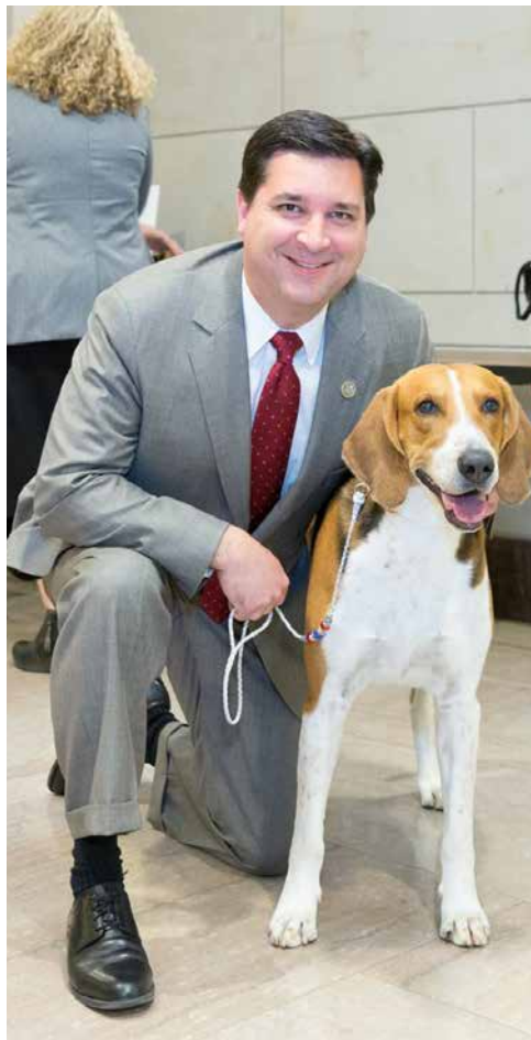
Congressman David Rouzer and Jackson

AKC Government Relations Department (919) 816-3720 • doglaw@akc.com www.akc.com/government-relations