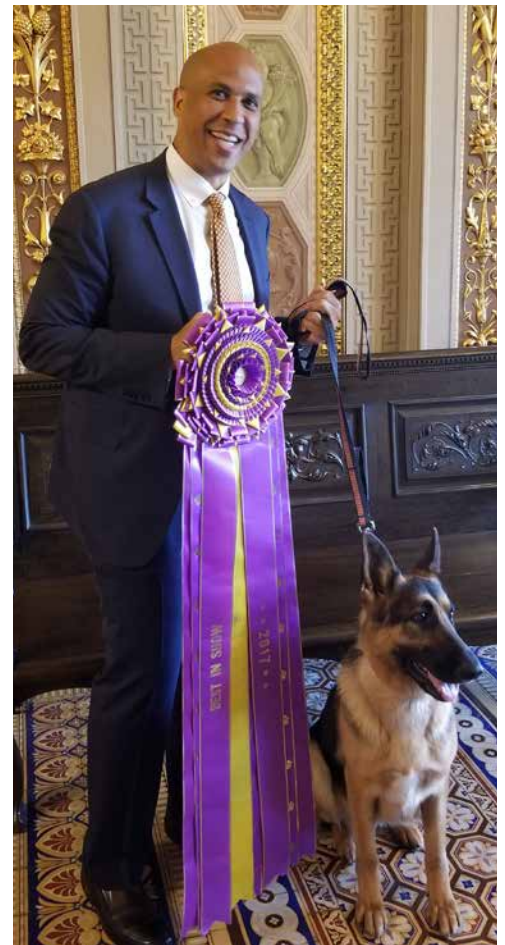
Senator Cory Booker

Congressmen Ted Yoho, Kurt Schrader and Ralph Abraham— that set aside May 1 as National Purebred Dog Day and celebrate the diversity, predictability and heritage of purebred dogs (Read more on page 8).