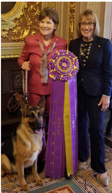
Senator Jeanne Shaheen and Senator Maggie Hassan