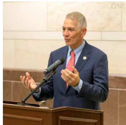
Congressmen Ted Yoho, Kurt Schrader, and Ralph Abraham speak to attendees at the National Purebred Dog Day Reception.

U.S. Congressmen and veterinarians Ted Yoho [R-FL-3], Ralph Abraham, [R-LA-5], Kurt Schrader [D-OR-5] and have joined forces across the aisle to introduce a Congressional Resolution in support of National Purebred Dog Day. U.S. Senator Thom Tillis [R-NC] also introduced a Senate Resolution in support of the day and in celebration of purebred dogs.