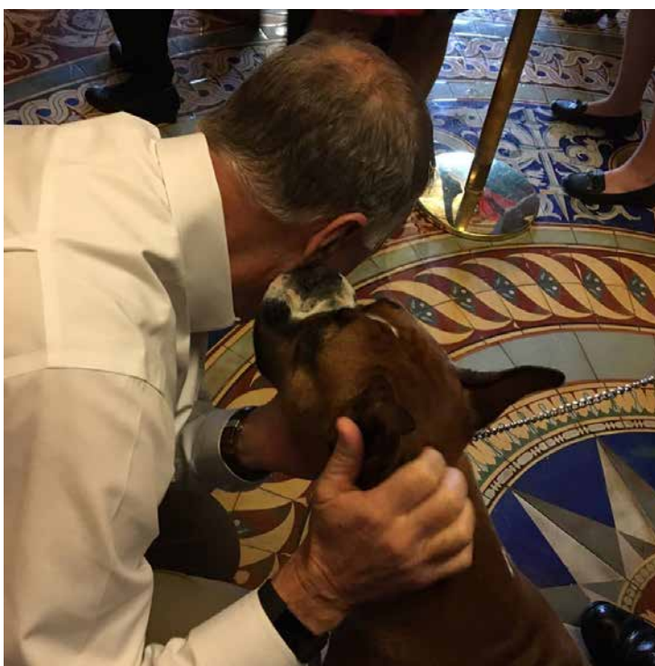
Nixy greets Senator Thom Tillis

purebred breed was developed for a specific purpose. From search and rescue and working dogs to service animals and loyal companions, purebred dogs continue to play a critical role and I am proud to sponsor this legislation that recognizes their contributions to our country.”