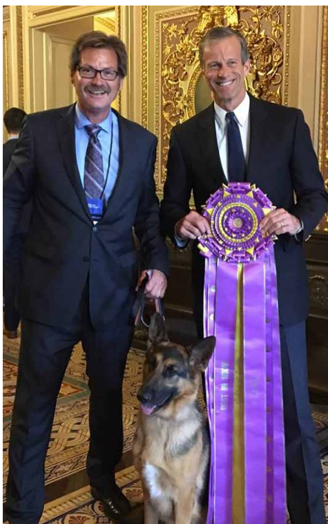
Senator John Thune