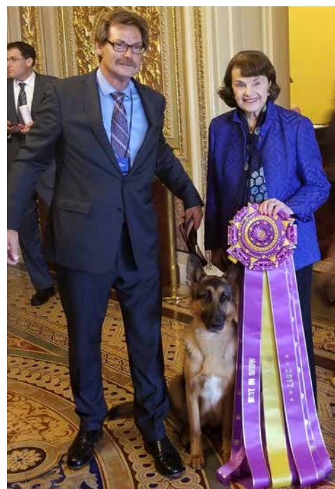
Senator Dianne Feinstein

AKC Humane Fund's grants to domestic violence shelters that enable victims to seek shelter with a pet 1 ; AKC Canine Health Foundation's $5.9 million in 2017 for grants for canine health research; AKC support for research and pilot programs that provide specialized service dogs for veterans with Post-Traumatic Stress Disorder (PTSD) and Traumatic Brain Injury (TBI) 2 ; and the crucial national security value of American-bred detection and other working K9s.