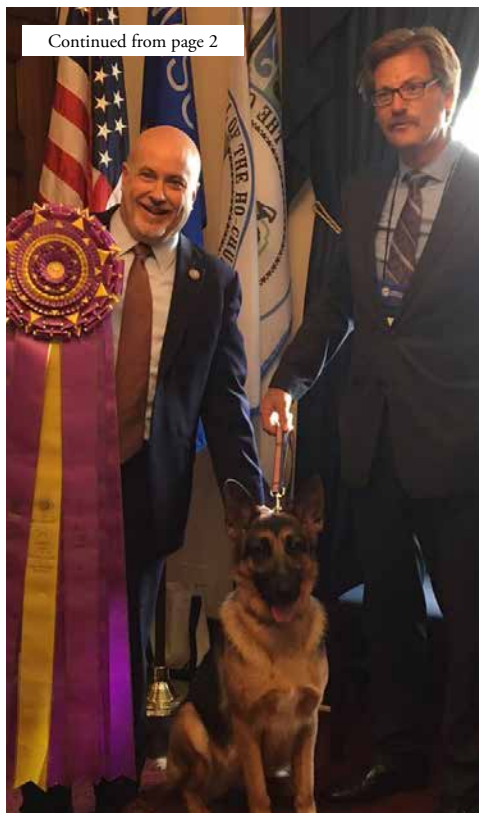
Rep Mark Pocan