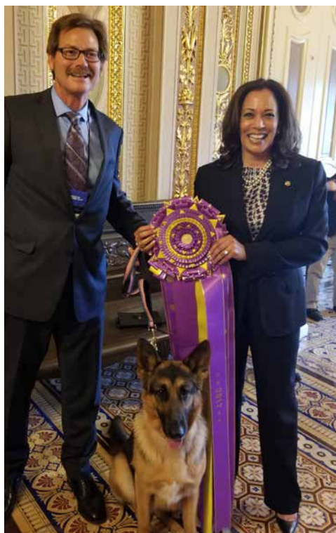
Senator Kamala Harris