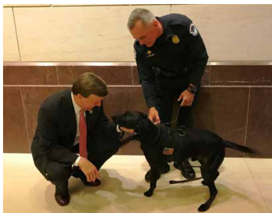
Congressman Mike Rogers with US Capitol Police Canine "Will."

The American Kennel Club presented the United States Capitol Police K-9 Unit with the AKC K-9 Officers Award on May 1. The award recognizes the special public service role of dogs that work for government agencies, and the skills and partnerships the K-9 handlers have with their dogs.