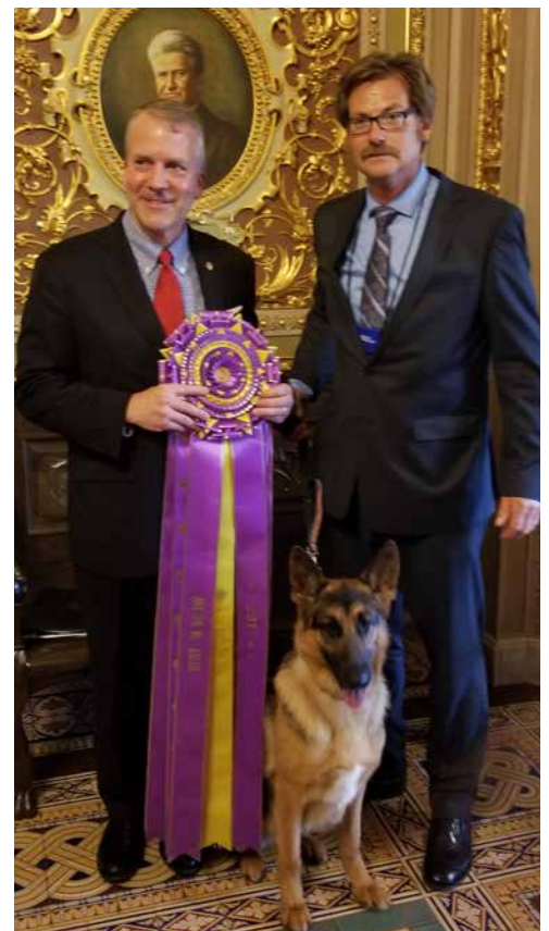
Senator Dan Sullivan

Attendees enjoyed refreshments and learned about purebred dogs; the dedication of responsible breeders; and AKC programs that advance purebred dogs and the health and wellbeing of all dogs. Educational stations highlighted information about AKC programs and affiliates, including: