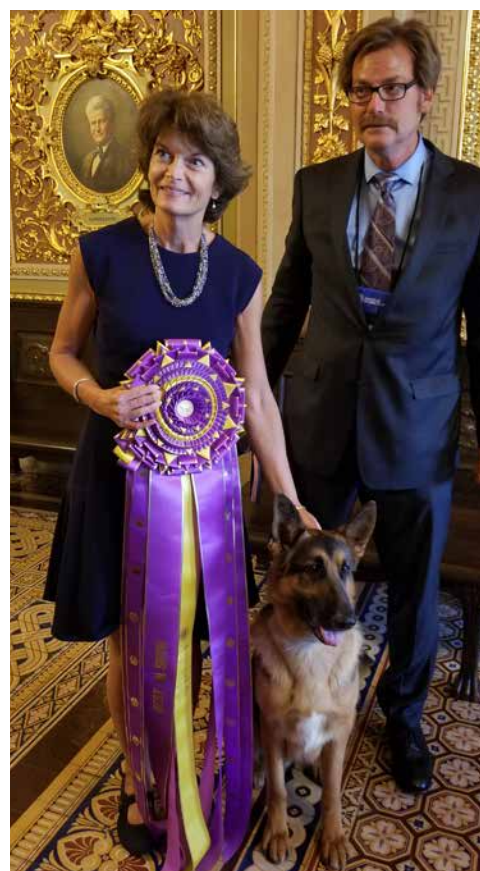
Senator Lisa Murkowski